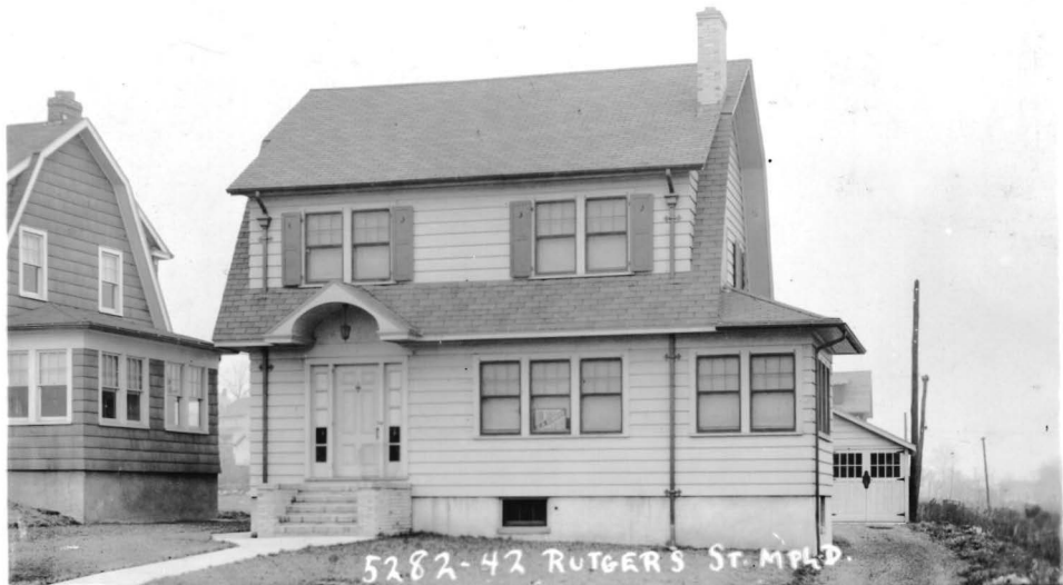
BOARD OF REALTORS of the GRANGES & MAPLEWOOD - Photo by BELDEN & CO